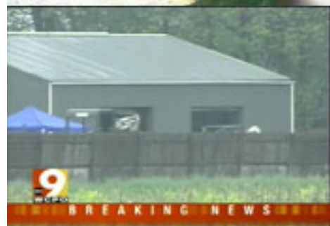
The pole barn in Brown County where a tip led investigators to search for the remains of Carrie.