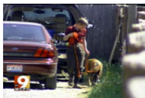
This was the fourth cadaver dog that was brought in. All of the dogs brought in picked up a scent of a cadaver.